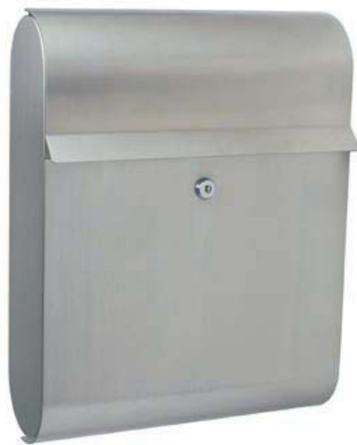
stainless steel (grade 316) with security key lock