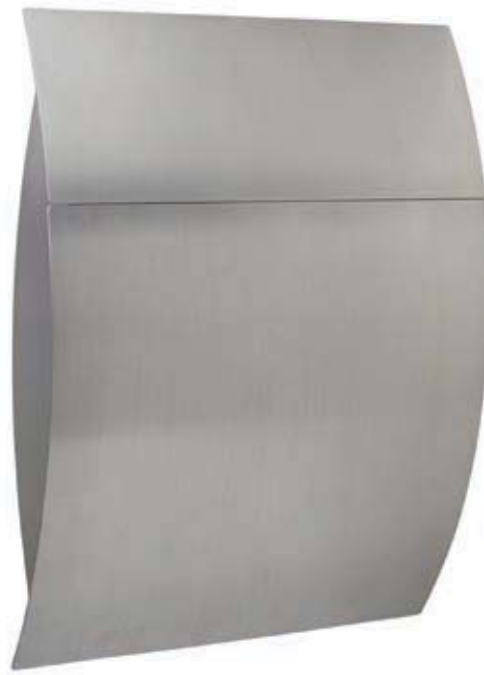
stainless steel (grade 316) with security key lock